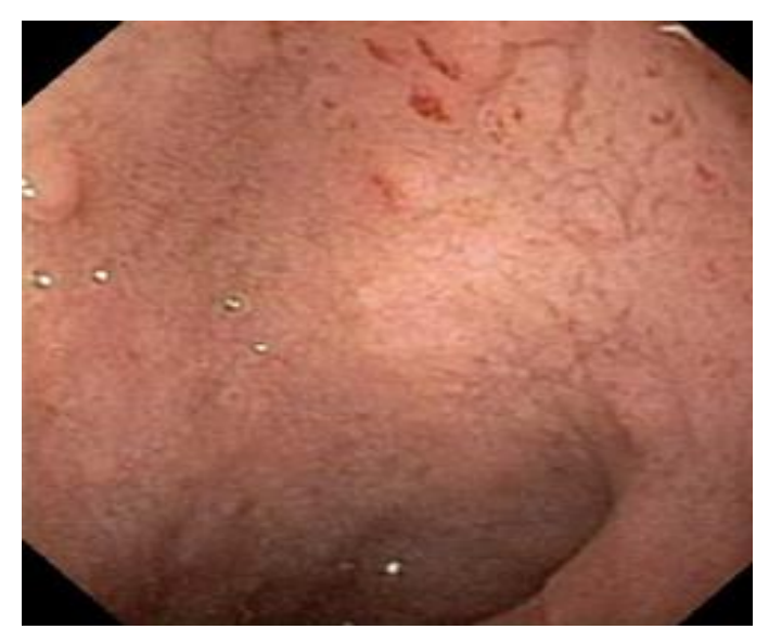
Figure 1. Endoscopic image showing nodular mucosa and erosions in the second part of the duodenum

B-cell lymphomas . Neoplastic follicles in PFL-D lack for the tingible bodies in macrophages that characterize the normal Follicles. Superiority of Centrocyte that missing the typical polarization considered as second characterization of neoplastic follicule (Takata et al. 2014). In Non-Hodgkin lymphoma; the most common extranodal types in GIT involvement are diffuse large B-cell lymphoma (DLBCL) and extranodal marginal zone lymphoma of mucosa-associated lymphoid tissue (MALT lymphoma). The ease is the way when trying to set the difference between DLBCL that has the diffuse infiltration of atypical lymphoid cells from PFL-D and in the meanwhile MALT lymphoma also exhibits lymphoepithelial lesions and it is from the rarity to show nodules. A discriminatory characteristic of PFL-D is the unparalleled appearance as white enlarged villi or white spots that differ in their sizes as seen endoscopically (Iwamuro et al. 2015). Although immunohistochemical phenotypes, histological and molecular aspects have many in common to say about in between PFL-D and Nodular FL ; Distinguishing features for both are always there (Ana-Iris et al. 2011). Low-grade (grade 1-2) has been solely encountered for PFL-D and high grade (grade 3) seen in 10%-20% of Nodal FL from histological point of view specified the difference in between (Who Classification of Tumours of Haematopoietic and Lymphoid Tissues. 2018; Kodama et al. 2007).