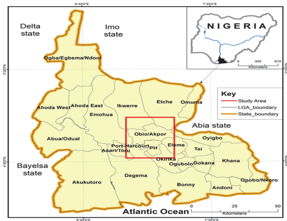
Figure 1. Port Harcourt Metropolis and Environs