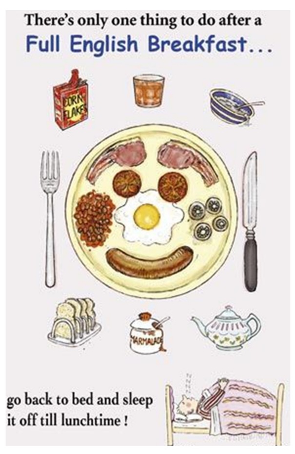
Figure 1. Illustrative figure, depicting a traditional, full English breakfast

These cultural differences are those which children more easily recall and might certainly be the key to the Kingdom, as they provide a window of opportunity for children to access the target Culture. Alternatively, an authentic storybook might be another way of providing children access to foreign-speaking worlds (i.e. vocabulary and grammar), as the language embedded is the target language and strengthening their Intercultural Communicative Competence. Therefore, to teach children these cultural contrasts in their early primary school years is to create within them naturalness in accepting different cultures where different languages are spoken