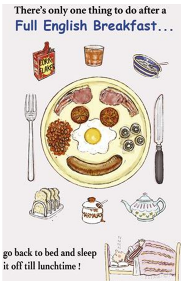
Figure 1. Illustrative figure, depicting a traditional, full English breakfast

These cultural differences are those which children more easily recall and might certainly be the key to the Kingdom, as they provide a window of opportunity for children to access the target Culture. Alternatively, an authentic storybook might be another way of providing children access to foreign-speaking worlds (i.e. vocabulary and grammar), as the language embedded is the target language and strengthening their Intercultural Communicative Competence. Therefore, to teach children these cultural contrasts in their early primary school years is to create within them naturalness in accepting different cultures where different languages are spoken