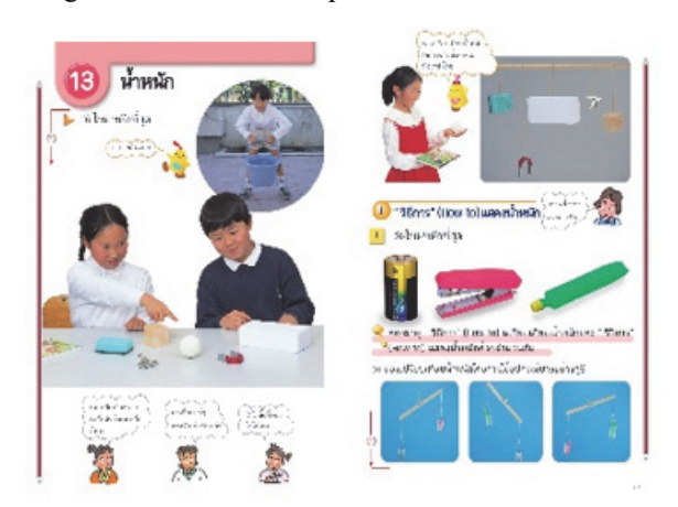
Figure 3. The Lesson of Weight from the Translated Japanese Textbook

The teacher trainees tried to design problem situations that would lead students to guess the weight of some stuff through their learning activity. They wondered how to introduce those kinds of stuff to their students. Figure 3 shows the content domain of weight in the translated Japanese textbook.