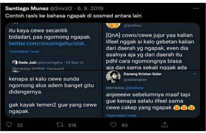
Figure 4. Screenshot from Twitter on Ngapak Language

Social media Twitter also shows evidence that ngapak language was sometimes degraded and even got racist treatment, as stated in a twitter posting below (Munez, 2019):