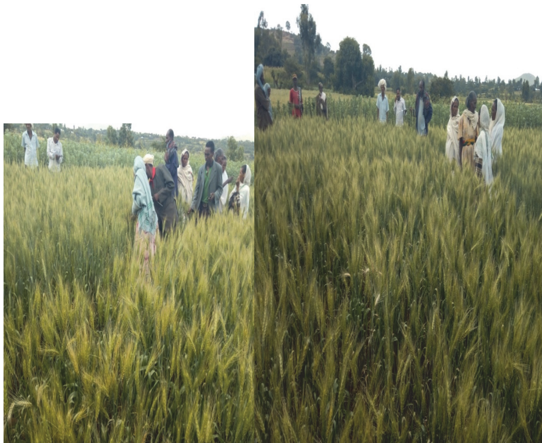
Figure 2. Participatory variety selection